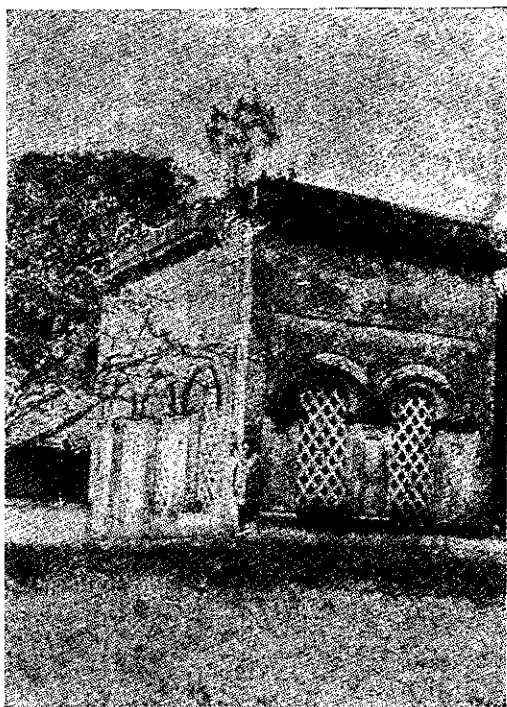
Shahbag Ashram, Dhaka