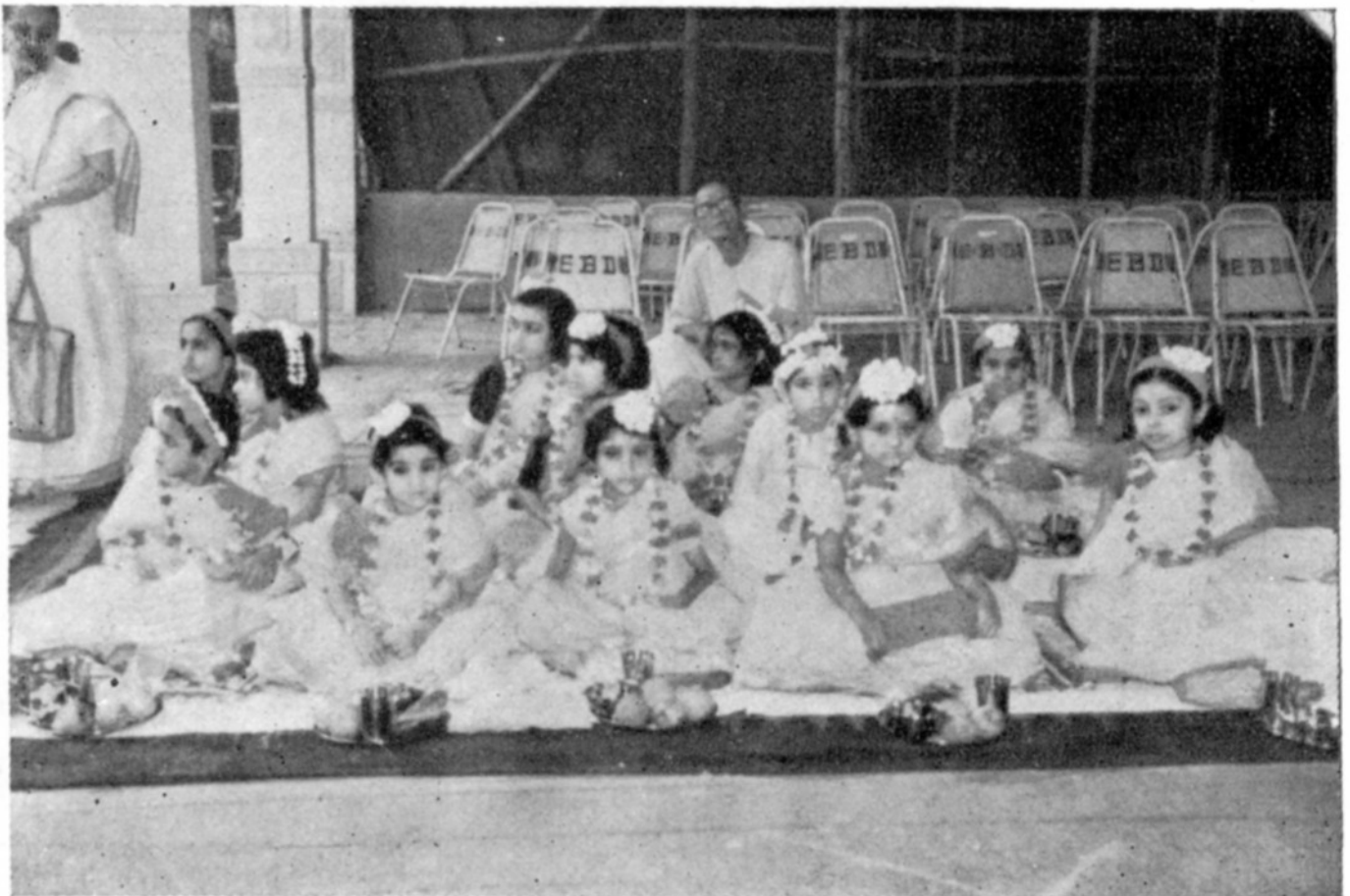
Kumari puja ( 11 Kumaris & one Batuk ) on 19.3.90 in Matri-Mandir