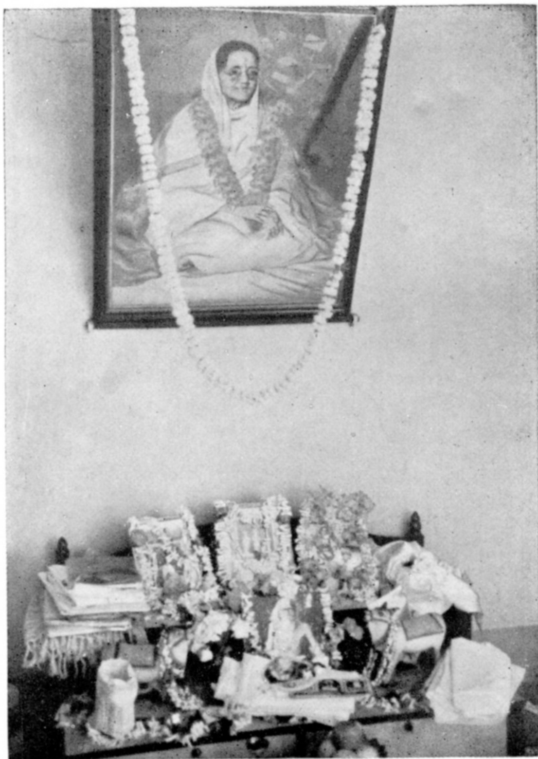
Shrine Room at Matri-Mandir where daily puja and Ved-patha are done