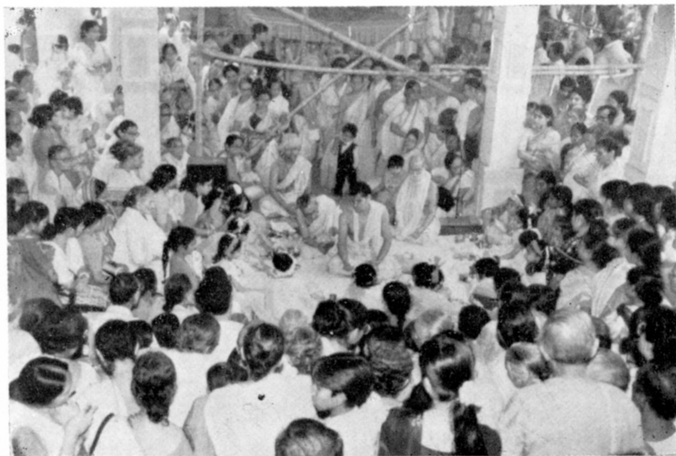
Devotees around the Special Mandap where 8-day long Shree Shree Sat-chandi concluded on 19.3.90