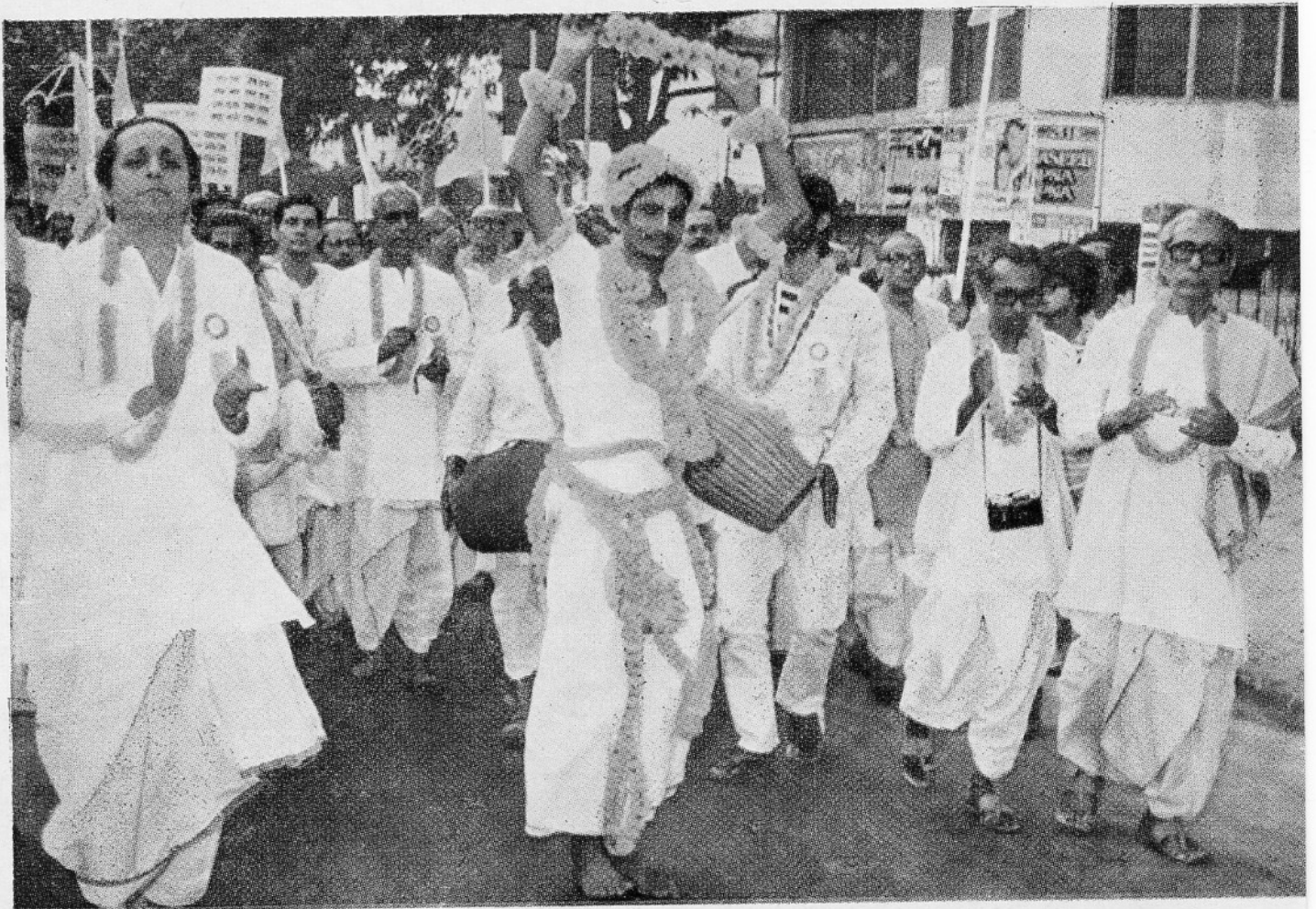
Nagar Sankirtan by Ma's devotees on the occasion of 500th Birthday celebration of Mahaprabhu Chaitanya