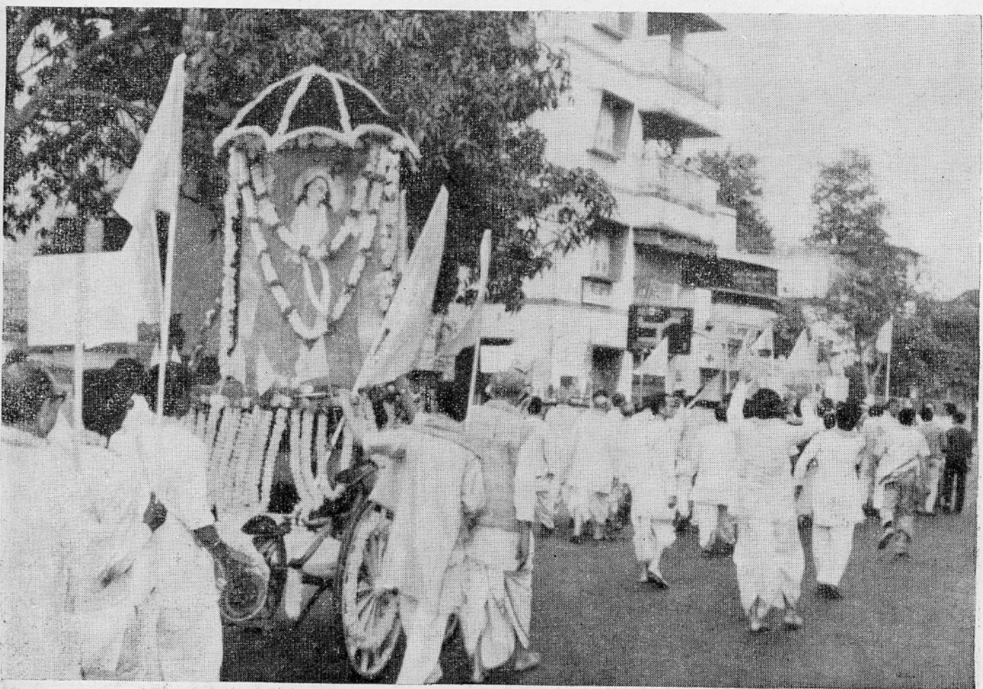
Nagar Sankirtan by Ma's devotees on the occasion of 500th Birthday celebration of Mahaprabhu Chaitanya