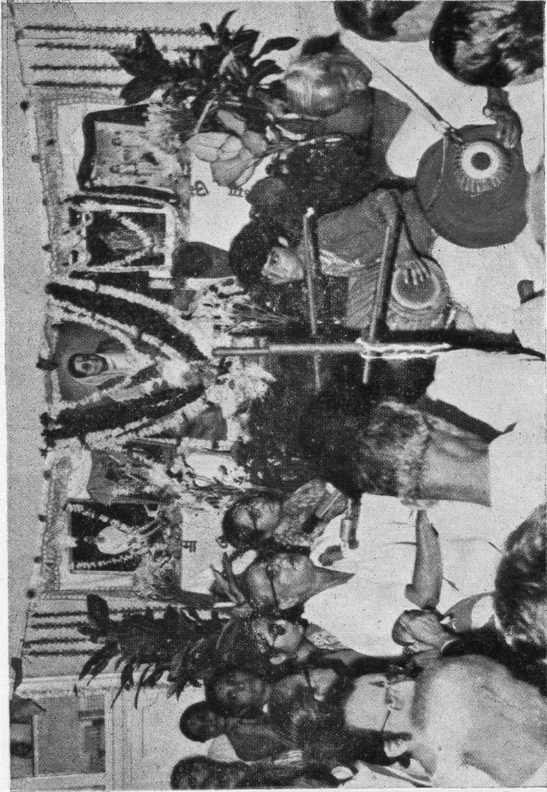
Nam-Sankirtan on 4. 8. 85 in MATRI-MANDIR