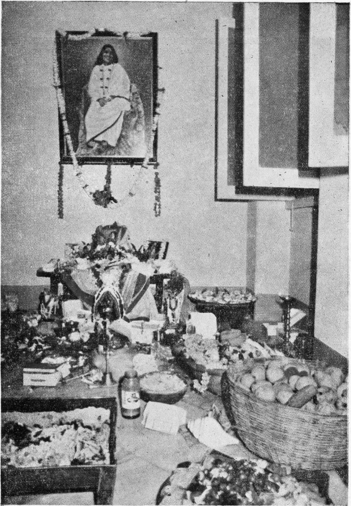
A view of the "Shrine" after puja in MATRI-MANDIR on 4. 8. 85