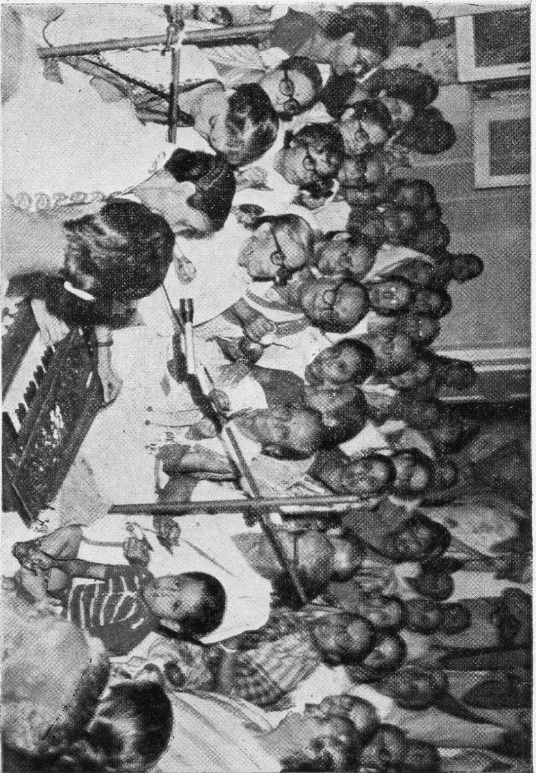
Nam-Sankirtan on 4. 8. 85 in MATRI-MANDIR