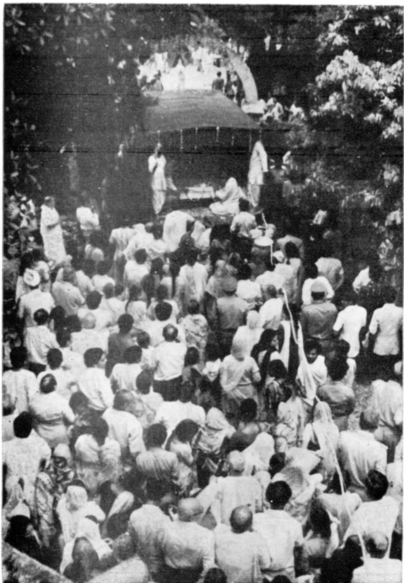
A View of Procession